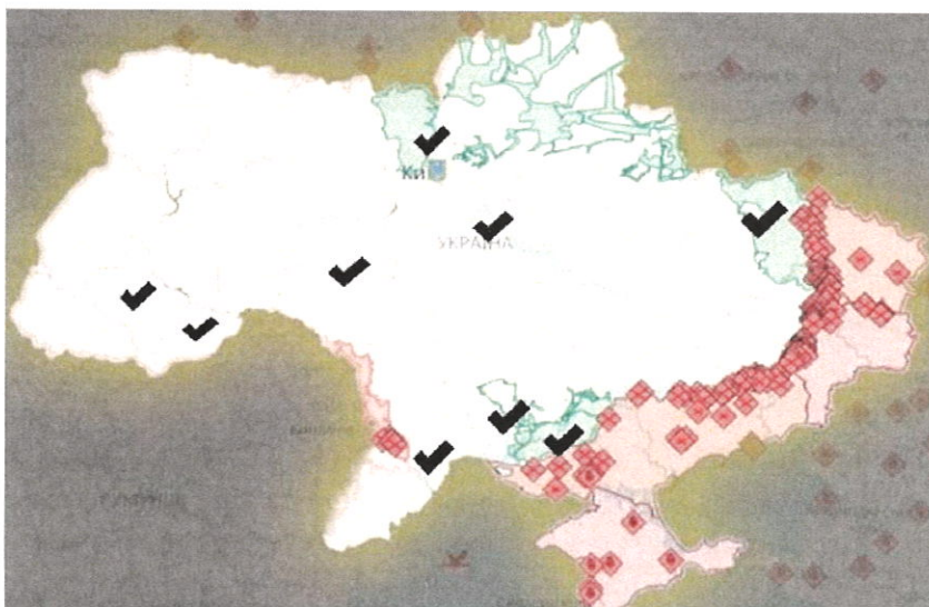
Picture 1. Map of active hostilities in Ukraine with marks in the areas where food packages were delivered within the project "Food packages", supported by the Eparchy of Saints Peter and Paul of Melbourne during June - August 2023